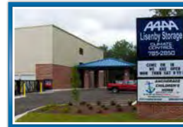
Panama City, FL