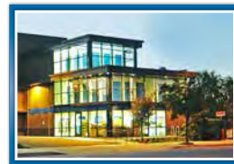
San Pedro, CA

Contact the Talonvest team to discuss your 2016 financing needs: