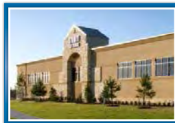
New Braunfels, TX