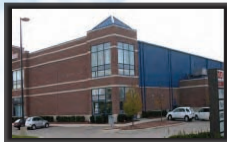
Ann Arbor, Michigan